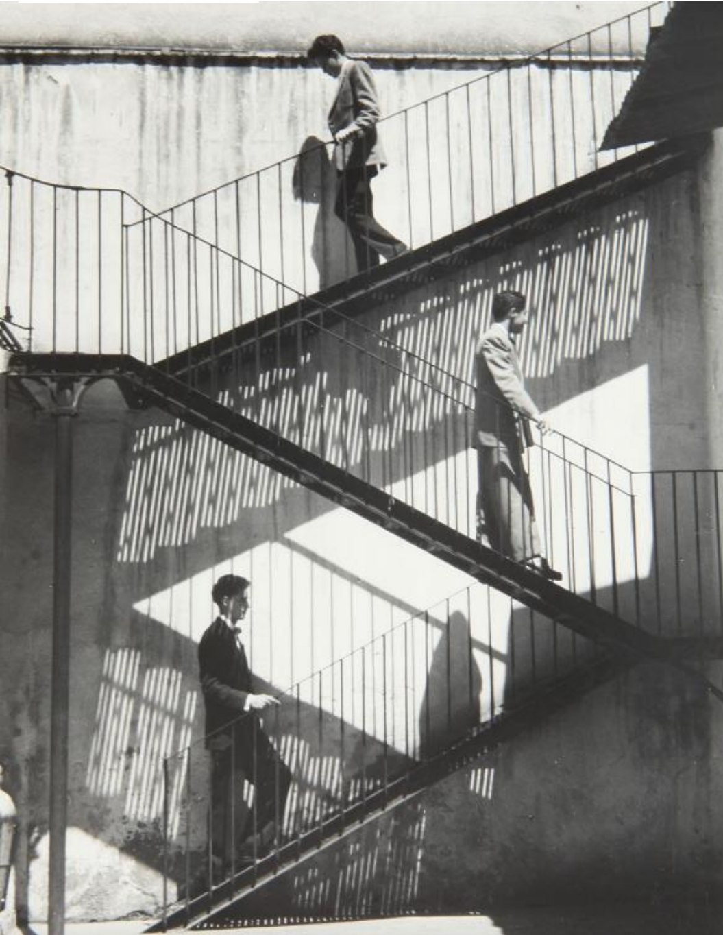
Some go up and others go down , Lola Álvarez Bravo, 1940 (El Museo Nacional de Bellas Artes Argentina)

Scan here with your mobile device to get future updates.