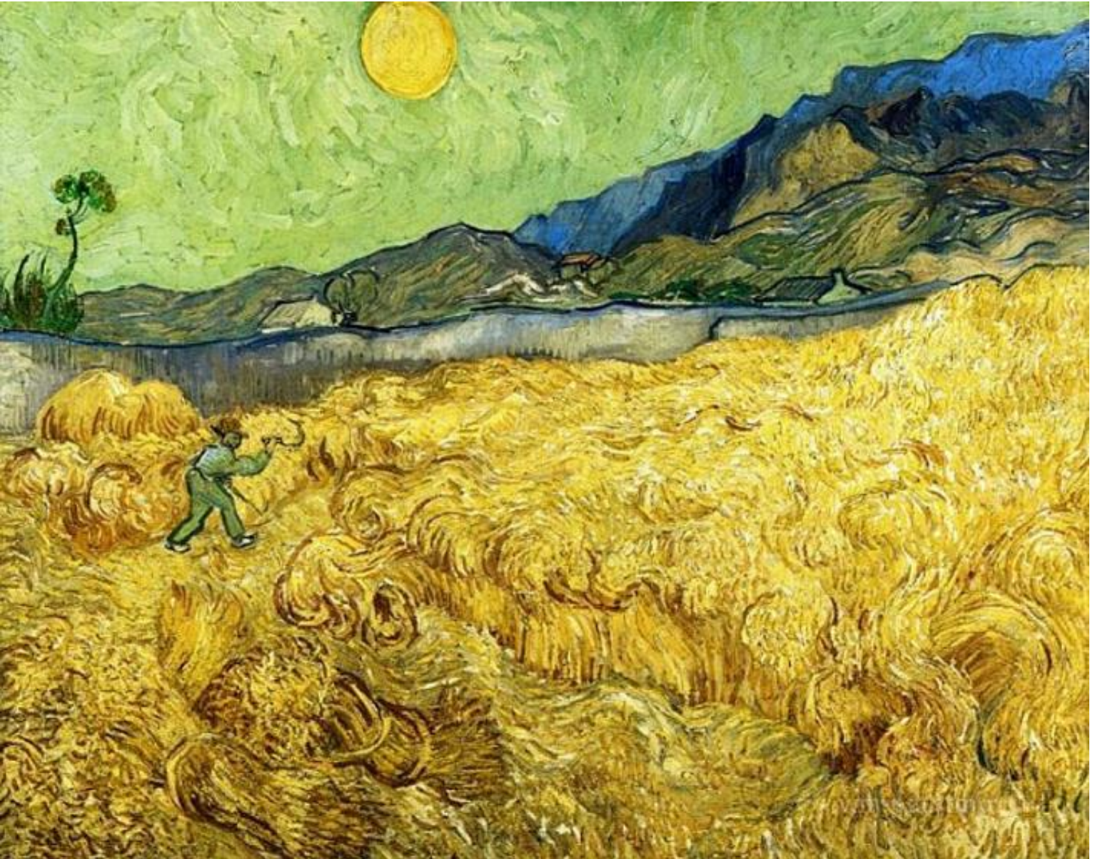
Wheatfield with a Reaper , Vincent van Gogh, 1889 (Van Gogh Museum)

Scan here with your mobile device to get future updates.